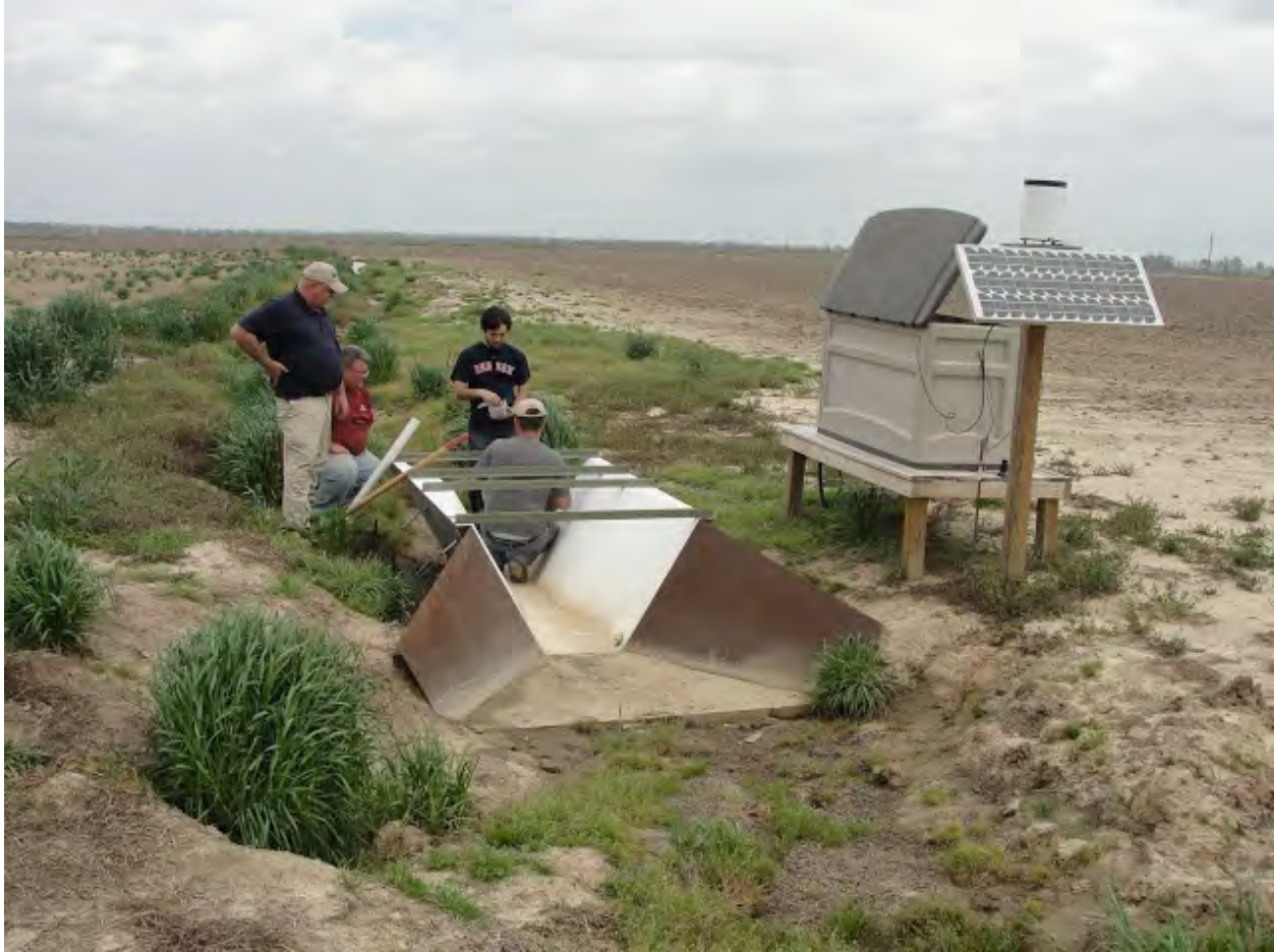
Photo 4. Trapezoidal flumes at the central drainage or pour point at the edge of the field. The automated ISCO sampler is housed in the adjacent storage shed and is powered with 12-volt deep marine batteries recharged by solar panels.