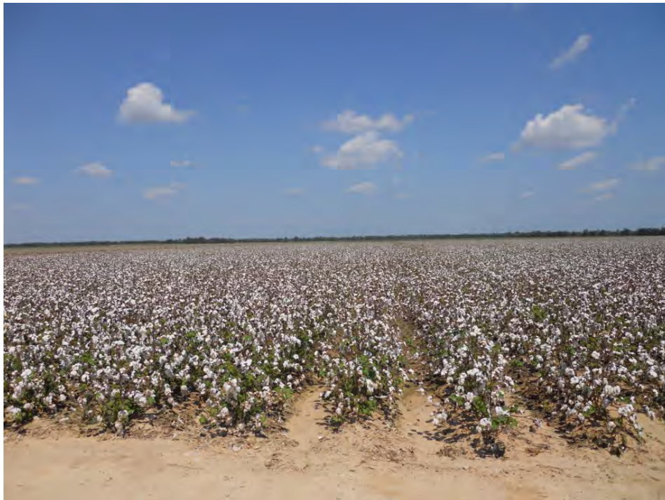
Cotton Field monitored at the Stevens farm.