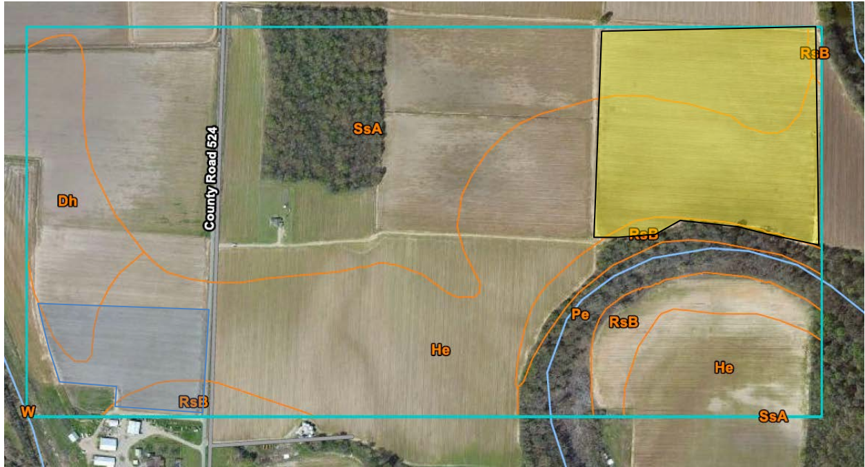
Photo 3. Soils map for area of interest for fields DUM2 (shaded in blue) and DUM3(shaded in yellow).