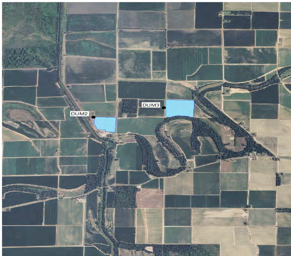
Photo 2. Layout of DUM2 and DUM3 fields where existing monitoring is being conducted on the C.B. Stevens farm, Tillar, AR.