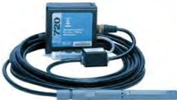
Photo 6. ISCO 720 flow module equipped with a pressure transducer encased in submerged probe that automatically determines stage in the stilling well of the trapezoidal flume. The ISCO 720 is a plug and play option for the ISCO 6712 sampler to measure runoff volume.