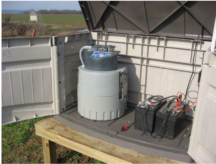
Sampling equipment at each monitored site. ISCO 6712 auto samplers will be used at all sites coupled with an ISCO submersible pressure transducer.