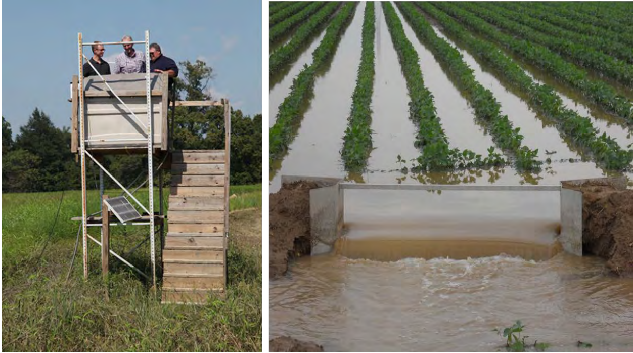
Photo 4. Monitoring station set up at existing Wood field is equipped with a box weir integrated in crop flood levee to collect flow similar to the one above. The Isco sampler was elevated several feet off the ground as winter and spring flooding is common. The submerged probe that houses the pressure transducer is placed in a stilling well out in the field and offset from the weir so that the initial height of water in the stilling well corresponds with the bottom of the box weir.