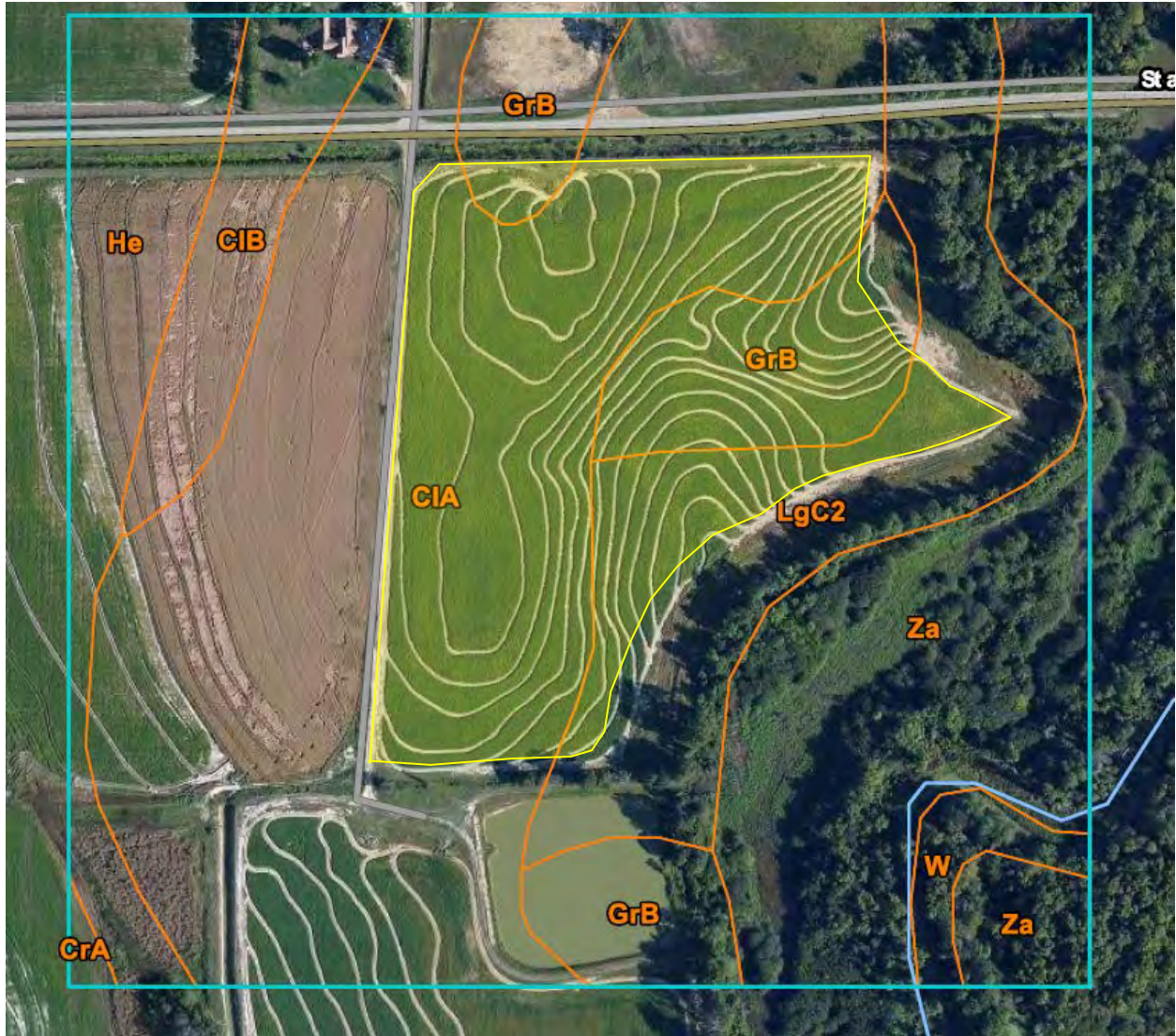
Photo 3. Soil survey map for the existing monitoring location on the Mike Wood Farm in Cross County, Arkansas.