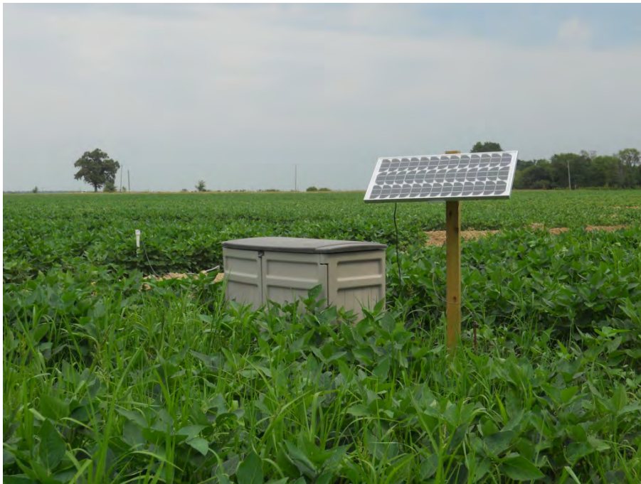
Soybean field monitored at the Woods farm.