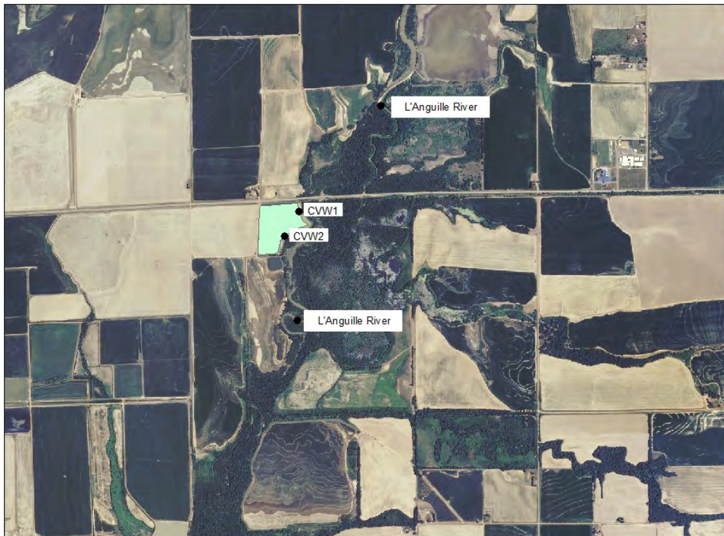
Photo 2. Layout of the existing field that is being monitored on the Mike Woods farm, Cherry Valley, AR. CVW1 and CVW2 refer to the dual monitoring stations at the two separate central outlets.

combination of groundwater and surface water from the L'Anguille River, when available. The field has two central outlets, where runoff volume and water quality is being determined at each outlet and results combined to determine the entire field effect. The bottom of the field is bordered by a switchgrass buffer implemented under the Conservation Reserve Program (CRP). We will continue to monitor the field to quantify the effects of conservation tillage and conservation crop rotation.