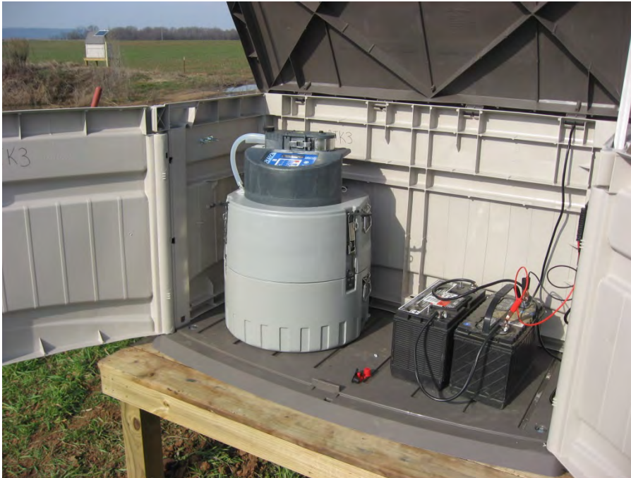
Photo 5. ISCO 6712 portable automated water sampler that integrates runoff water quality sampling with a with stage (determination accomplished with an ISCO 720 flow module that utilizes a submerged pressure transducer placed within the field and in front of the box weir to determine runoff flow volume. The unit is powered by two 12-volt deep marine batteries in parallel and recharged by a solar panel.